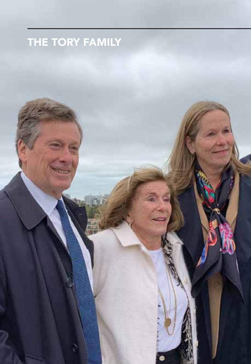
Opening of the Sunnybrook helipad atop the Tory Trauma Centre.